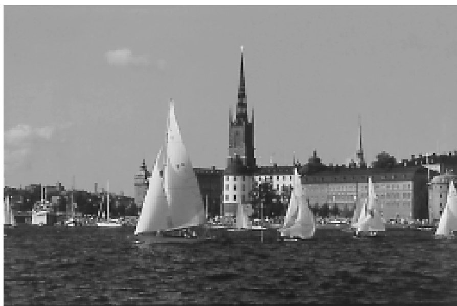
Next summer the largest and most beautiful tall ships will visit Stockholm