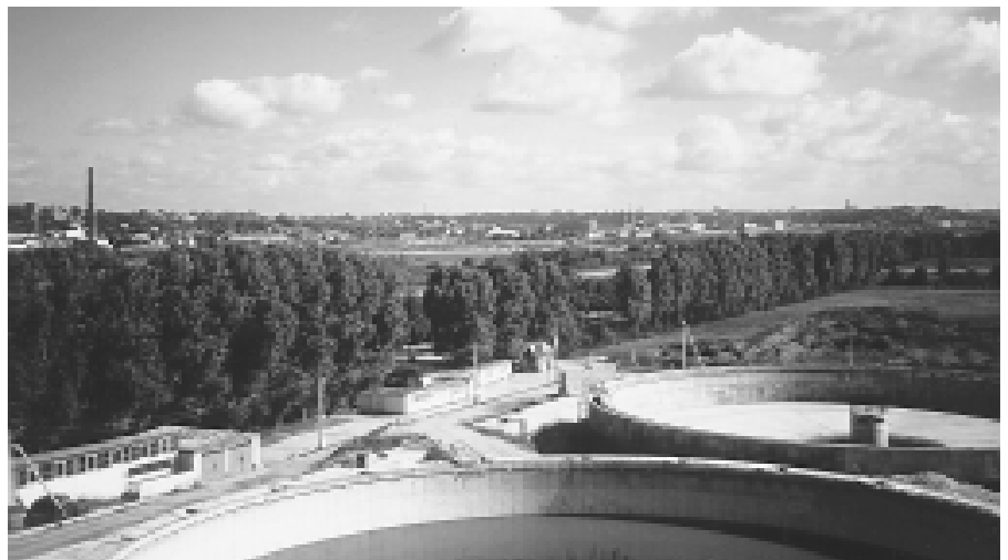
Sewage treatment plant in Kaunas is scheduled to be in full operation in May 1999.

The Government of the Republic of Lithuania has financed more than a half of the project. Other co-financers are Kaunas City Municipality, European Bank for Reconstruction and Development, EU-PHARE, SIDA, NEFCO and the Finnish Ministry of the Environment. Some of the means needed will be gathered by increasing the tariffs for water supply and sewerage in the City of Kaunas.