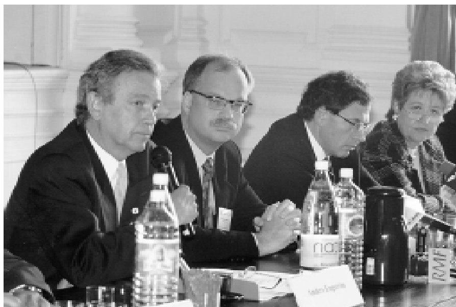
President Engström, Mayor Posadzki, Minister Rosati and Commissioner Wulf-Mathies on a lively press conference.

Panel discussion were followed by workshops: Agenda 21 - Local, Regional and Governmental cooperation, European Union in the Baltic Sea Region today and tomorrow - a challenge for Baltic Cities, Local self-government in the Baltic Sea Region - tendencies and obstacles, and