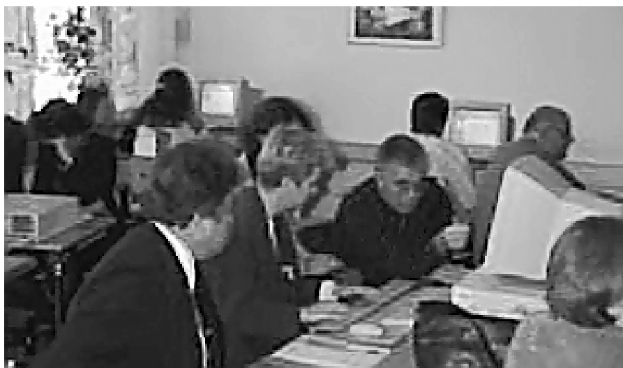
Task Force members updating the Baltic Sea Alliance data system in Kalmar.

The UBC is one of the founding fathers of the Baltic Sea Alliance, - a www-platform for practical project management. This was introduced also in the meeting and it received quite an enthusiastic response. All UBC member