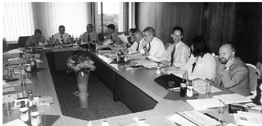
The closed session of the Executive Board was mainly devoted to the UBC Strategy