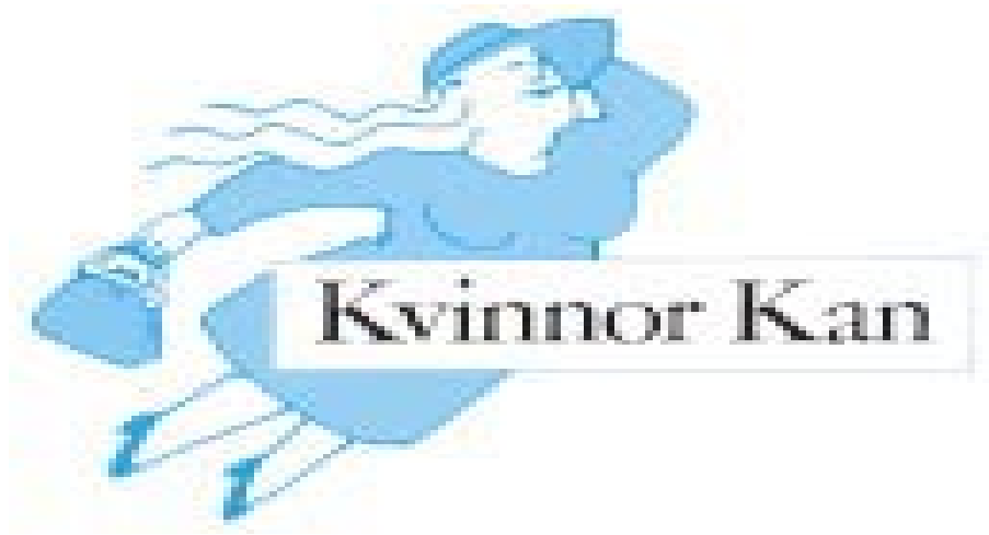
UBC Local Agenda 21 being discussed in Nacka.

The participants discussed also how Local Agenda 21 could be integrated into