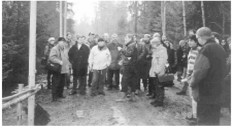
Participants on an excursion to the Valciunai oil terminal.

programme, which started with a brief introduction to common remediation methods and their costs. The methods presented after that were containment and stabilisation methods, thermal cleaning methods, use of air for cleaning contaminated sites, phytoremediation as well as in-site and off-site bioremediation. The participants were pleased to hear that there are many different solutions to solve the problem with contaminated soils. However, there is still much work to do in this field. On the third and last day of the seminar the participants visited the former military fuel storage Valciunai, which is a contaminated site south of Vilnius.