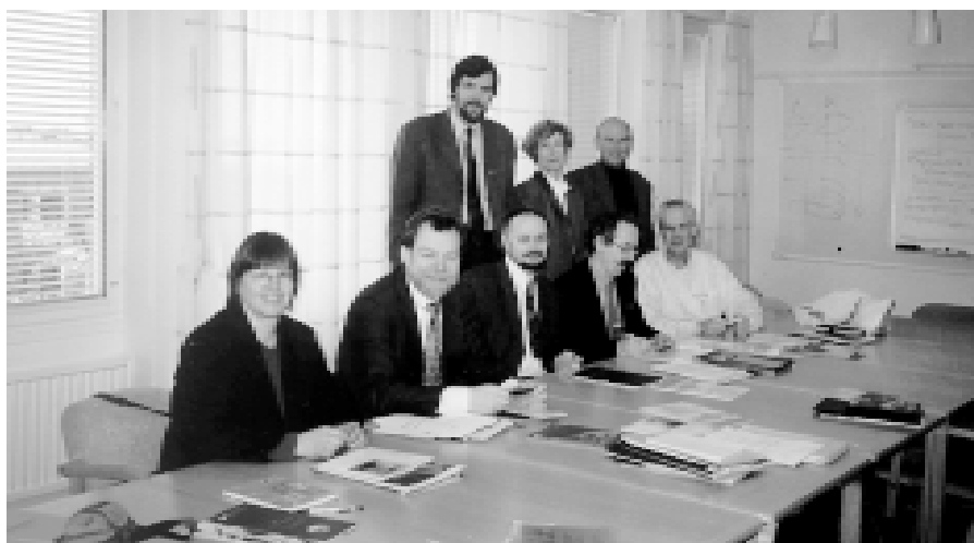
UBC Local Agenda 21 being discussed in Nacka.

The participants discussed also how Local Agenda 21 could be integrated into