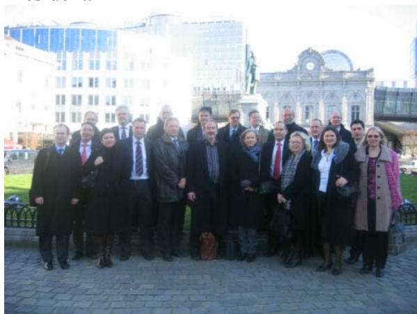
51 st Executive Board meeting, Brussels, 7 February 2008

http://www.ubc.net/today/51st-executive.html