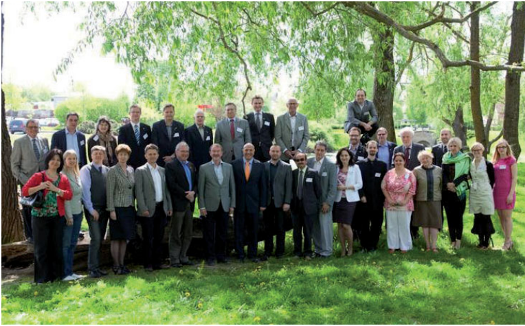
64 th UBC Executive Board meeting in Rakvere, 24 May 2012