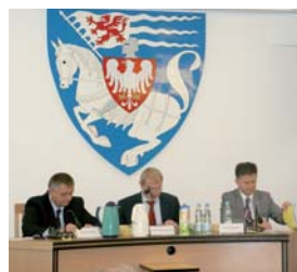
The Board in Koszalin, 4 October 2012, decided the main theme of the UBC General Conference in Mariehamn in 2013 would be how to tackle the problem of unemployment among youth.