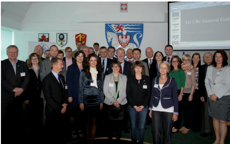
65 th UBC Executive Board meeting in Koszalin, 4 October 2012