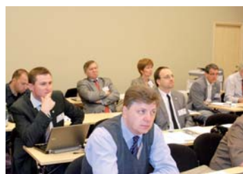
The Board in Rakvere, 24 May 2012, discussed inter alia how to strengthen the UBC presence in Brussels and enhance its lobbying capacity.