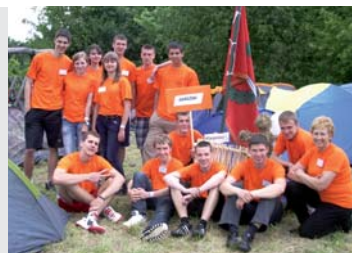
The youth from western Lithuanian municipalities during the summer academy gaining new useful skills.