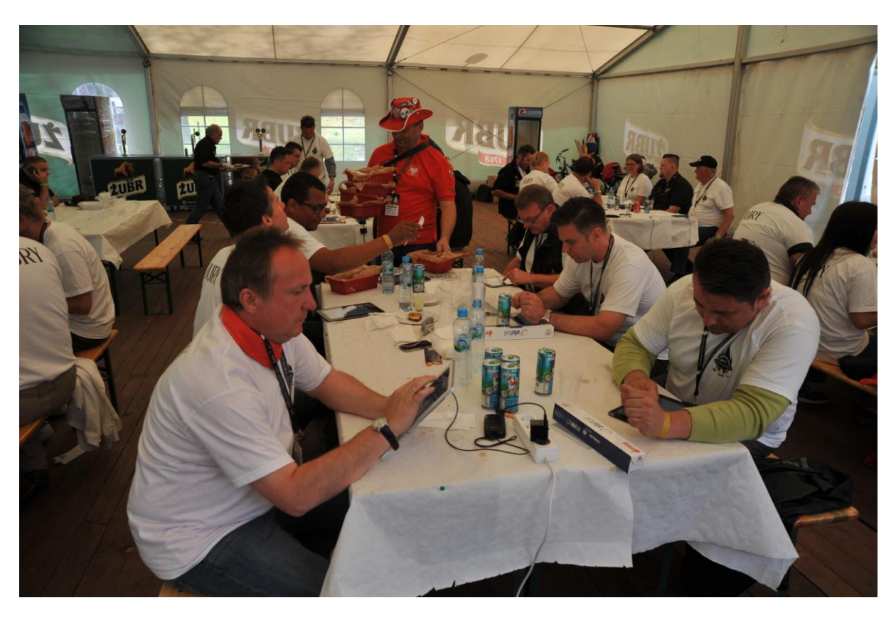
JURY – prepared for the competition, Charlotta BBQ Championships 2014.