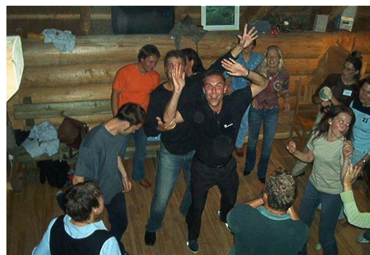
Sauna-house dancing in the woods of Latvia

dinner for the UBC delegates and the fare-well dinner for the Baltic Welcome