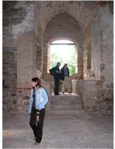
Visit to Cesis Castle