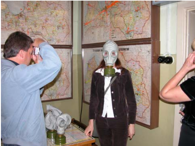
Visit to Sovjet underground bunkers

The Sunday started with an educational visit to Cesis Medieval Castle of course, followed by a most appreciated visit to Soviet underground bunkers, that was recently opened for the public. Thousands of square meters under ground, that almost no one knew about before!