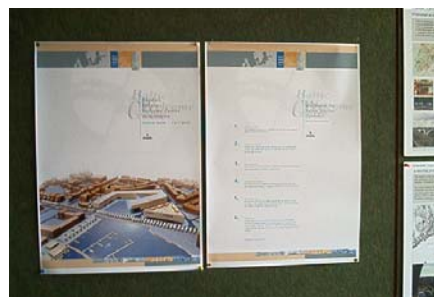
Exhibition of City of Schwerin, Germany

The meeting was opened the 23 rd of August with an open exhibition, held jointly with the Interreg IIIB project Baltic Welcome Center that was held just the days before the Commission's meeting. The participants had the opportunity to show their cities or regions and what they have to offer.