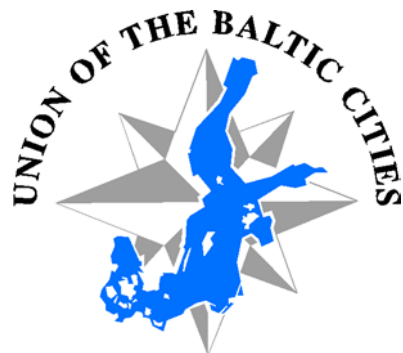
Commission on Tourism

The meeting this year was hosted by the City of Cesis !