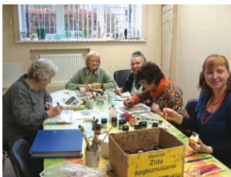
The theme of active aging and intergenerational solidarity is highlighted in activities oriented at public health, health promotion and social integration.

Since 2012 the Nordic walking classes have been available at seven day care centres for adults. Similarly, reinforced mental health promotion and dementia prevention support for the seniors are being provided in day care centres, providing the specialists with