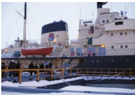
The participants had a chance to see the famous Snow Castle of Kemi and ice-breaker "Sampo".

During the meeting the participants had a chance to learn more about