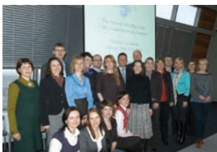
Twelve CoT members, guests and observers took part in the meeting

The second one - Enjoy South Baltic! – Joint actions promoting the South Baltic area as a tourist destination is a new and innovative cross-border project implemented by partners from Poland, Lithuania and Germany. The aim of the project is to strengthen the