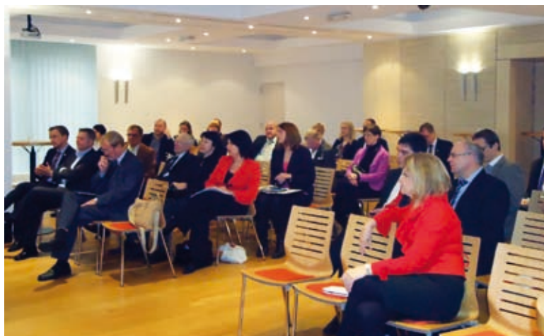
63 rd UBC Executive Board meeting in Brussels, 14 - 15 February 2012