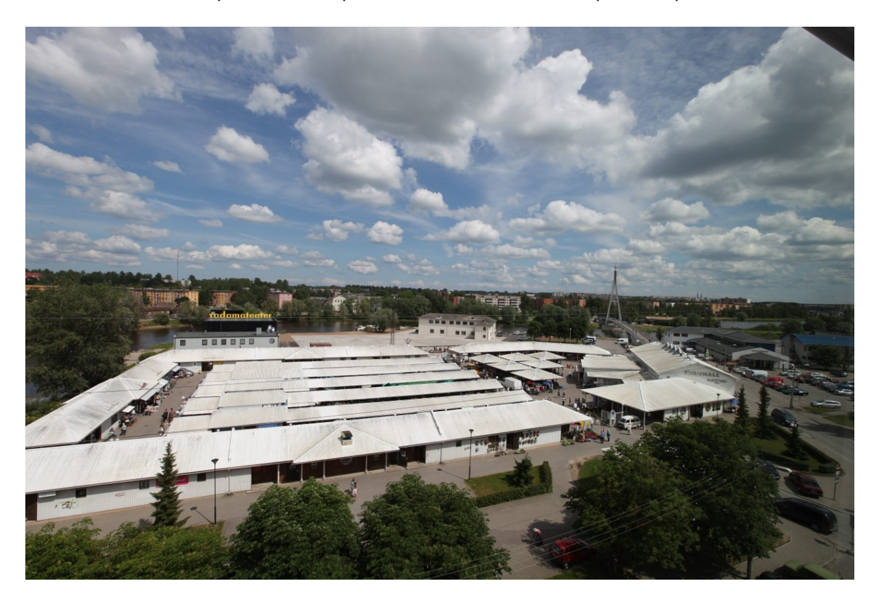
How should the riverbanks be used in more efficient way?