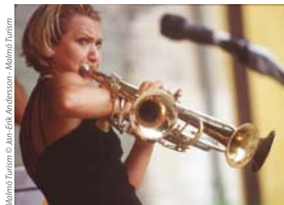
Malmö Tourism © Jan-Erik Andersson - Malmö Tourism