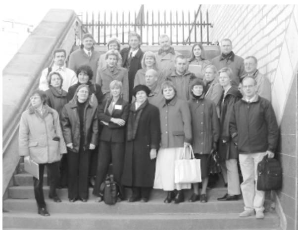
Some of the participants outside National Library of Estonia in Tallinn

On 25 April, an Annual Commission Meeting was held in Paldiski. The participants discussed how the commission can work and how to use the network as efficient as possible. The conference ended with a sightseeing tour the 26 th of April in the city of Tallinn. Next activity on the agenda is a meeting in