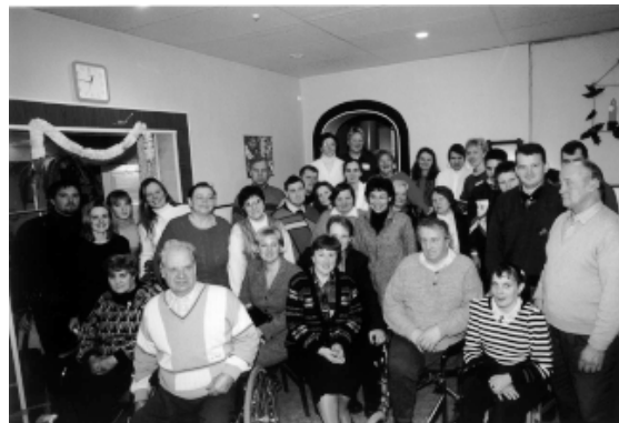
Chairperson of the Parliament, Ms Ingrida Udre together with Invalid Centre employees and clients

In the future, Tukums Day centre plans to develop a program to approximate the rehabilitation services to the residential