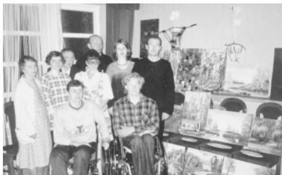
... from member's life of "Dailusis Ornamantas"

The City Council incorporates national social policy into the planning process and decision making and continuously pays attention to developing rehabilitation, making the physical