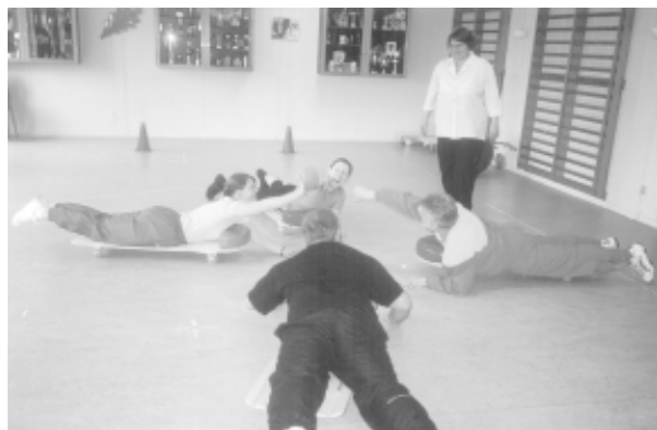
Members of the Commission on Sport during activities for the disabled in Association for Disabled in Aalborg

The Prize will be awarded for the best sporting event with participation of people with disabilities. The competition is addressed to all UBC member cities. The deadline for submission of application forms is 1 st October 2003. The city whose sporting event will be chosen by the Competition Committee as the best organised one will receive the prize of 3000 euros. The presentation of the Equal Opportunities Prize will take place during VII UBC Conference General in Klaipėda (Lithuania) in October 2003.