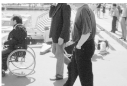
Elimination of physical barriers is only a part of activities of the City of Helsinki

operate in 1982. Again, the main principle was to design and construct the metro trains and stations for all. Hence, all metro stations were equipped with elevators, escalators, barrier free paths, and pedestrian sidewalks.