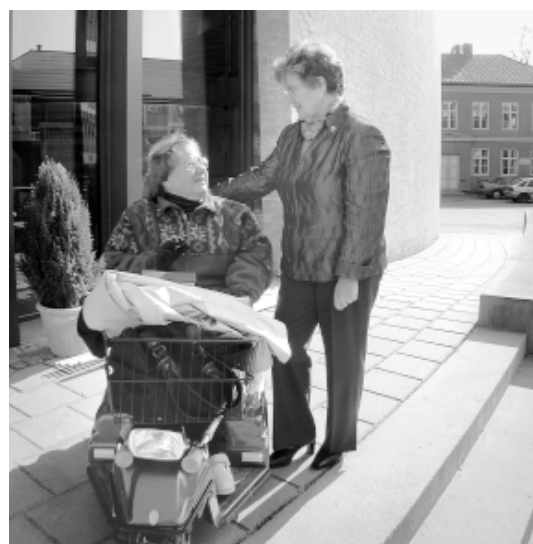
Kristiansand Museum of Art and other public places are easily accessible for the disabled