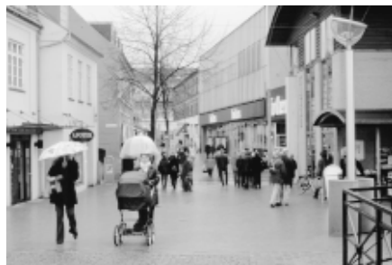
People strolling in the main shopping centre

UBC cities and towns are tried to define its meaning during the Kolding Seminar. The themes of the workshops were: