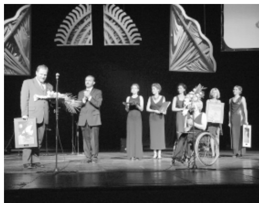
Gala of the competition „Gdynia without Barriers”

Moreover, flats adapted to the needs of the disabled have been built. At the same time programme of sheltered accommodation for the mentally handicapped (to enable them to live on