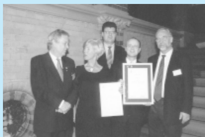
Gdańsk was the winner in the last edition of the Best Practice Environmental Award. Now it is time for your city to win!

Cities wanting to participate should follow the guidelines in the Award leaflet that will be granted in May. The applications should reach the UBC Commission on Environment Secretariat at the latest 1 September.