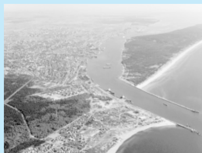
Welcome to Klaipėda in October 2003!