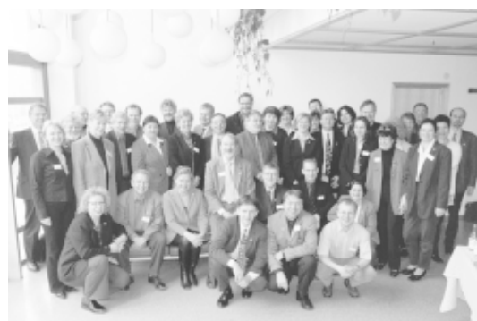
36th UBC Executive Board meeting was held in Umeå, Sweden, on 28-29 March 2003