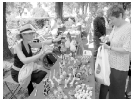
Hansa Market is very popular in Viljandi

The most famous event in town will be the Folk Music Festival. 11th festival takes place in July 24-27, 2003. There will be