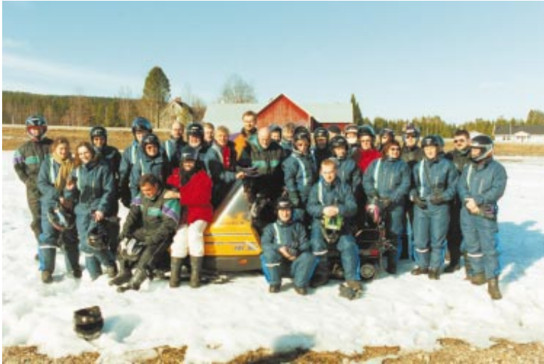
Executive Board members and chairmen of the Commissions getting ready for the hard work, Umeå, 28 March 2003