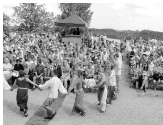
Famous Folk Music Festival is held every year in the city of Viljandi, Estonia