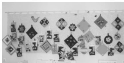
Piece of works made by the disabled are sold in the centre of Vilnius