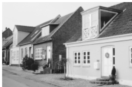
The historical centre of Kolding has been preserved and enlarged in a beautiful way, the scale of architecture is intimate