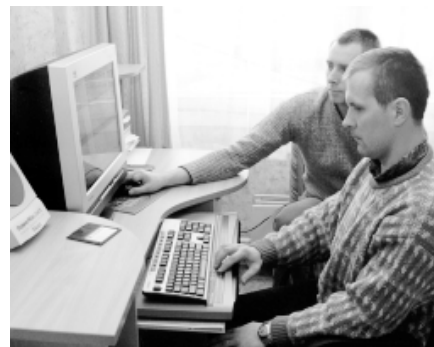
With a help of the scanner and the Braille Display the blind can read any non-specially prepared text

Blind with the support of the local government has also launched new projects: adjusting of the sports gym to the needs of the blind and establishing a hotel for the visually impaired in Liepāja.