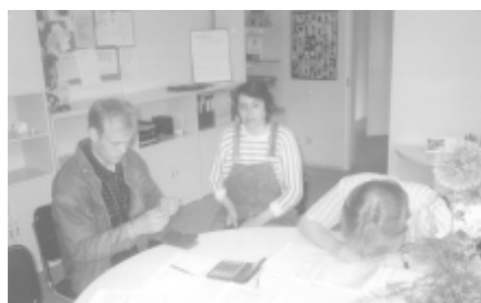
Pelagruna Support Centre

health to meet together on a regular basis, share experiences and ideas. Forum is using their expertise to identify problems and to develop creative solutions. It is not merely a 'talking club', but forum members initiate actions to improve mental health. Forum consists of representatives of Tallinn mental health NGO-s, (ex)users of services, family members, social workers, psychiatrists, local officials, academics, nurses, pharmaceutical company, journalists, religious groups, municipal service providers. Users have